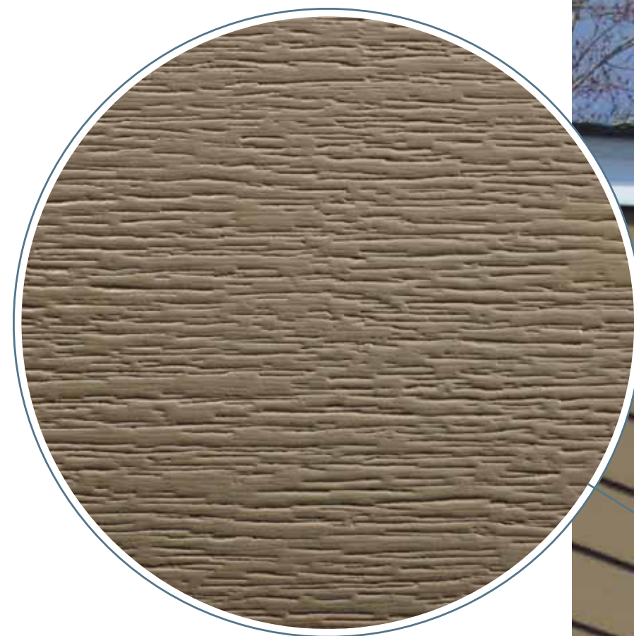
7" Cedar profile gives a realistic deep grain texture with natural shadow line.

CELECT FACTS: Finish Faster No special tools required Light & easy to install Return to normal faster